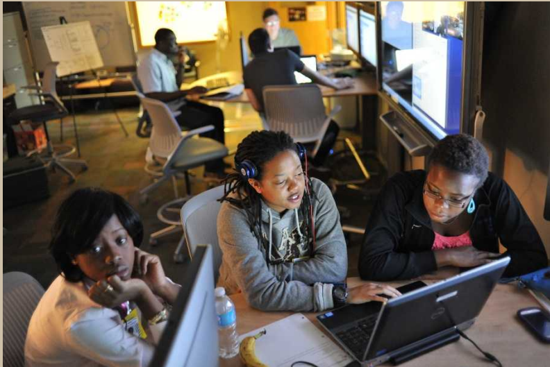
Minority-serving institute partnership program