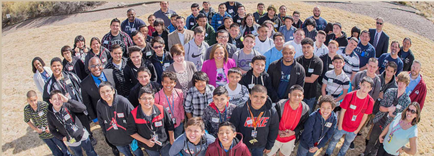
My Brother’s Keeper event