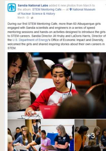
STEM Mentoring Café