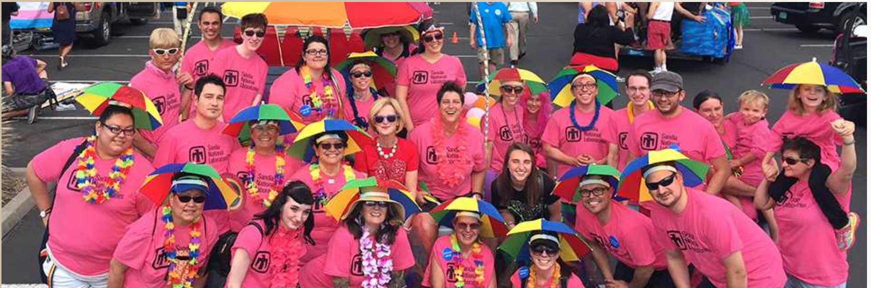
Sandia Pride Alliance Network at the Albuquerque Pride Parade