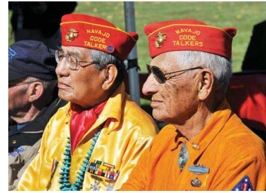
Navajo Code Talkers and Casey Church Dancers for Native American Heritage