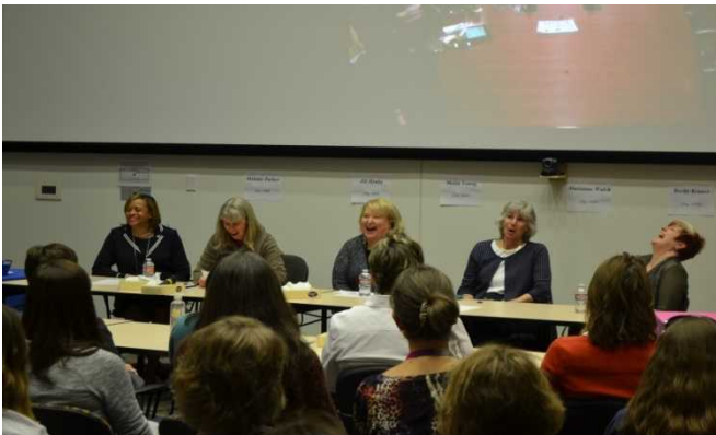
Executive Women's Leadership Panel 2015