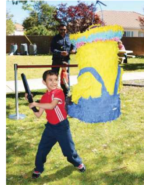
Hispanic Heritage / Manos