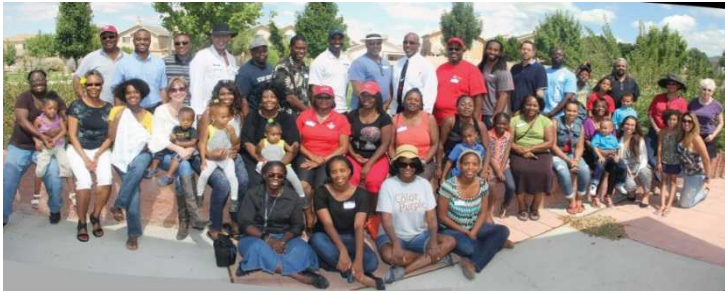
Black Leadership / HMTech