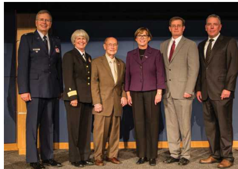
Veterans Day Speakers and Special Guests