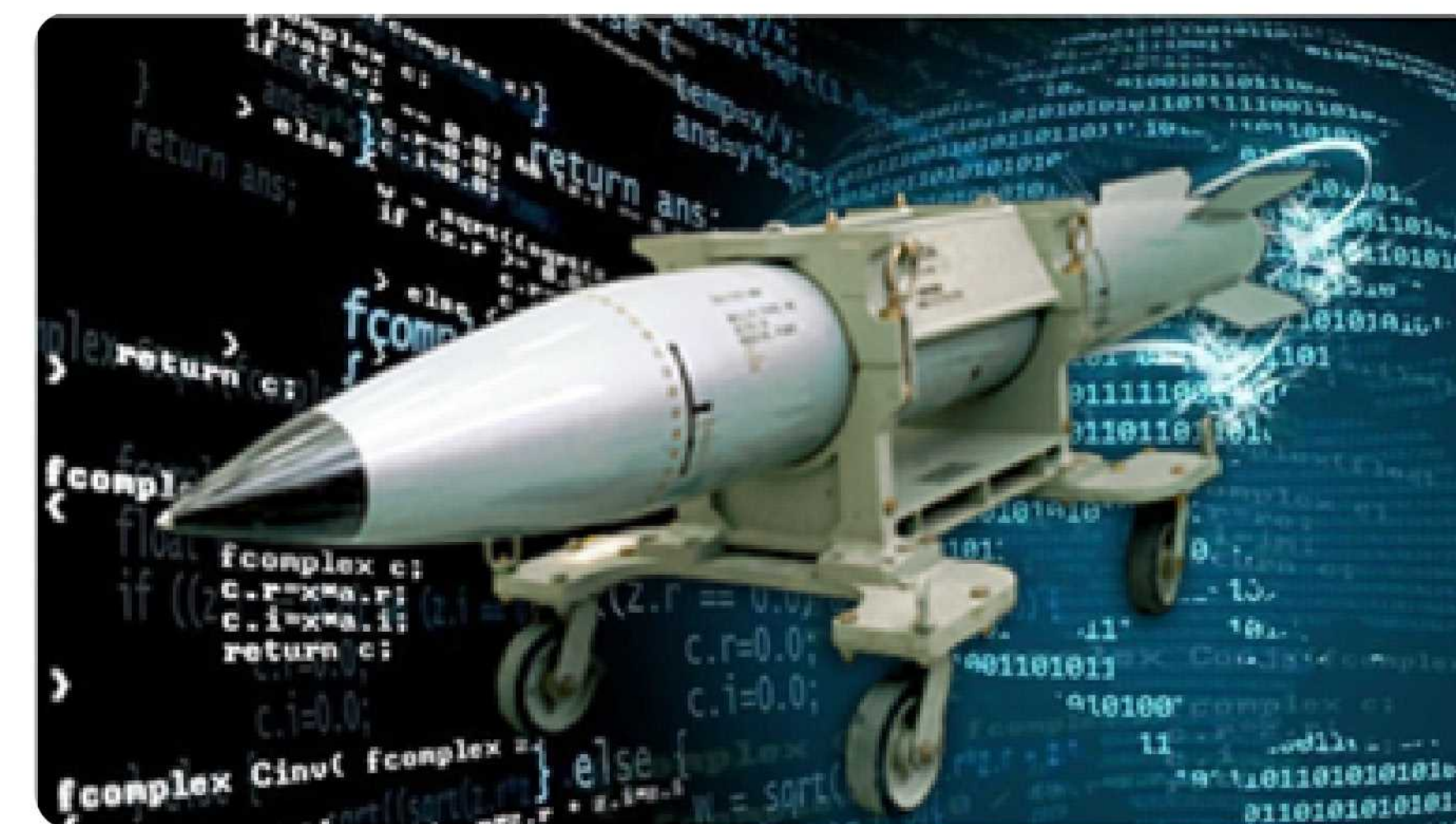
NCRT specializes in non-traditional cyber assessments: Heterogeneous networks, cyber-physical, nation-scale networks, ad-hoc networks, mobile devices, and special systems. NCRT supports cybersecurity for critical civilian, homeland security, and defense programs.