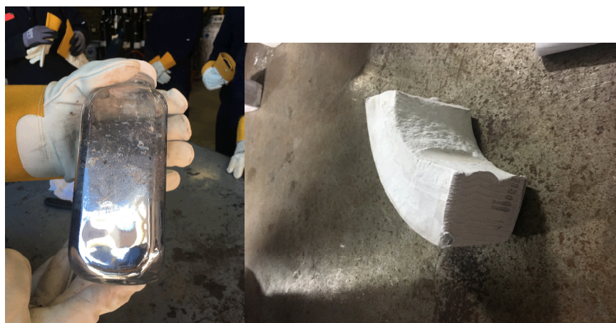
Figure 3. Showing NaK and Sodium

In regards to the hands on training personnel were able to handle alkali metals to see and understand the properties of NaK and sodium, see Figure 3.