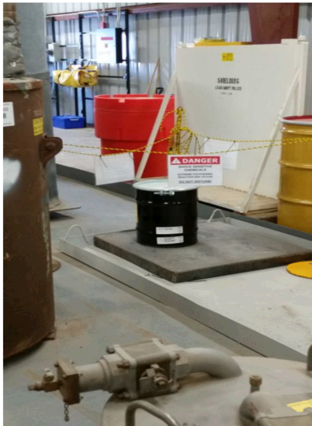
Figure 2. 10-gal container containing poly bottle with 2-3 ounces of NaK

As a result of the assessment, an operability review by MFC Environmental, Safety, and Health to ensure adequacy and compliance with applicable requirements was performed. This review concluded that the container was acceptable for storage and that the container was properly labeled and inspected per the permit. Based on review by Industrial Safety and Health several controls were put in place which included, limiting access to the locked building, isolating the container by roping and posting as “shock sensitive”, see Figure 2, and suspending forklift operations pending further expert analysis.