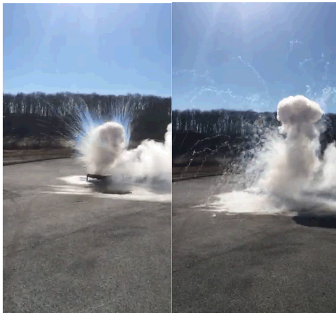
Figure 5. NaK reaction with water

dispersed little droplets of NaK up to several feet from the source. The reaction creates excessive smoke and fire, see Figure 5.