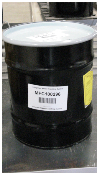
Figure 1. 10-gal container containing poly bottle with 2-3 ounces of NaK.

Complex (MFC) research building, located on the Idaho National Laboratory. Workers were transferring 2-3 ounces of NaK from a metal can to a poly bottle so that it could be sent off for characterization. During transfer to the poly container, a reaction of NaK with air was observed in the metal can and poly container. This was an anticipated event. As noted in a critique report the poly bottle also generated heat resulting in a silver dollar sized melted spot on the bottle 2 . In response the two containers were flooded with argon, closed and placed in a safe condition. The workers immediately made notifications and the fire department was deployed as a precautionary measure. The containers were observed overnight with no additional reaction noted. The following day the containers were further packaged into a 10 gal drum and moved to a Resource Conservation and Recovery Act-permitted storage facility. The container was labeled and barcoded with container number MFC100296, see Figure 1. The container was transported to the storage location via a drum dolly on foot for approximately two blocks from where it was generated. According to one employee the trip took several hours because the drum heated up significantly at the slightest bump. Long cool down periods were required between short moves.