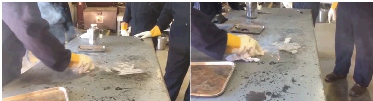
Figure 4. Cleanup of small spills of NaK

The hands on training included cleanup tips associated with small NaK spills by using damp cloths. A small amount of NaK was poured on metal tables and damp cloths were used in a swirling motion to react and clean up the NaK. Small sparks were noted from reacting the NaK, but no violent reactions were seen and cleanup of the NaK was able to be performed in a controlled environment, see Figure 4.