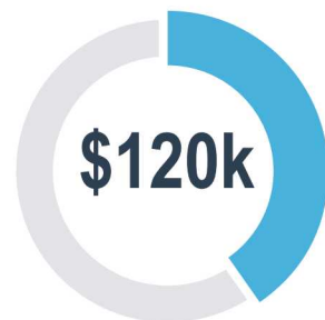
United Way of Central New Mexico Cornerstone