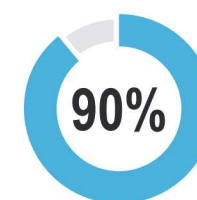
ALBUQUERQUE, NM $1,265k