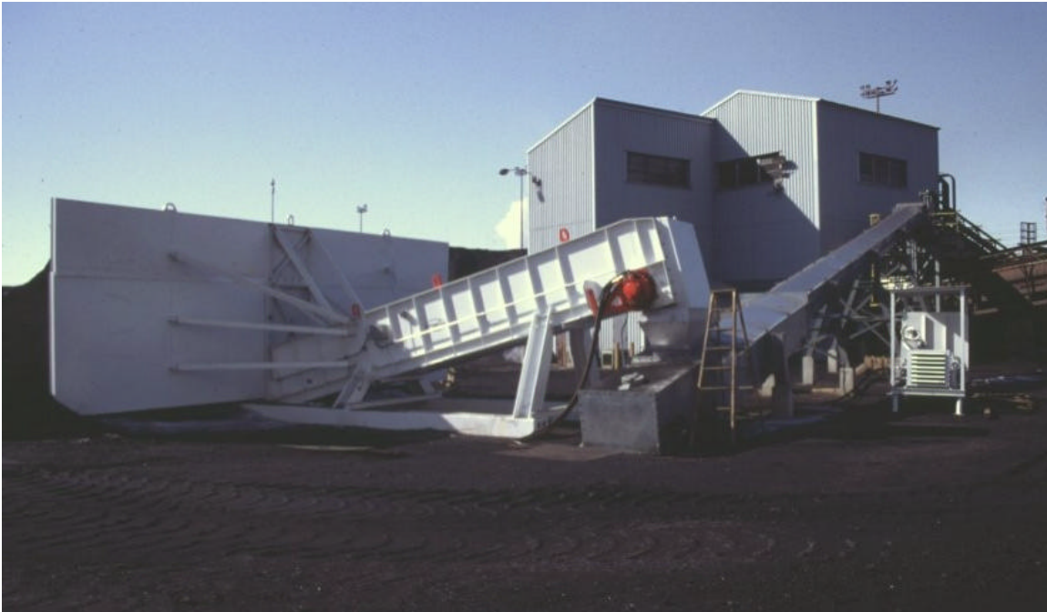
Figure 5. Close-up of Opportunity Fuel Reclaim System

The capital cost for the Bailly Generating Station opportunity fuel cofiring system is $1,185,685. Table 2 provides a cost breakdown for this system.