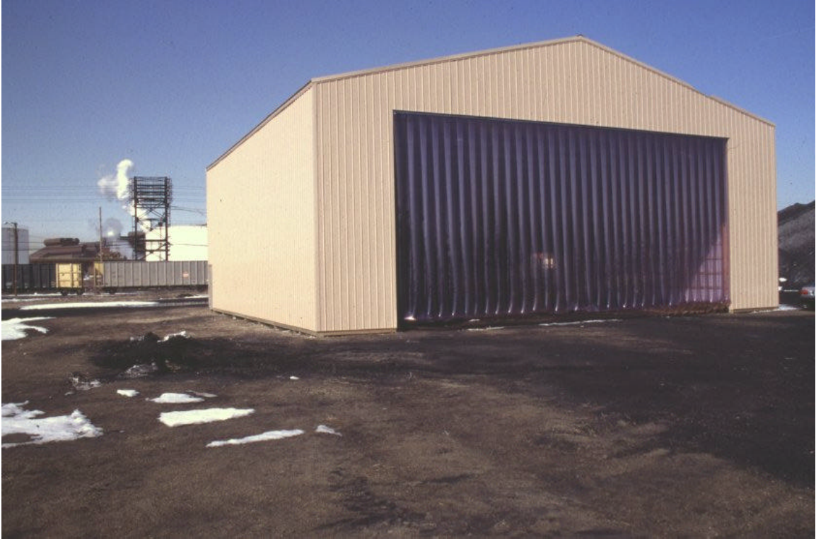
Figure 3. Pole Barn at the Bailly Generating Station.