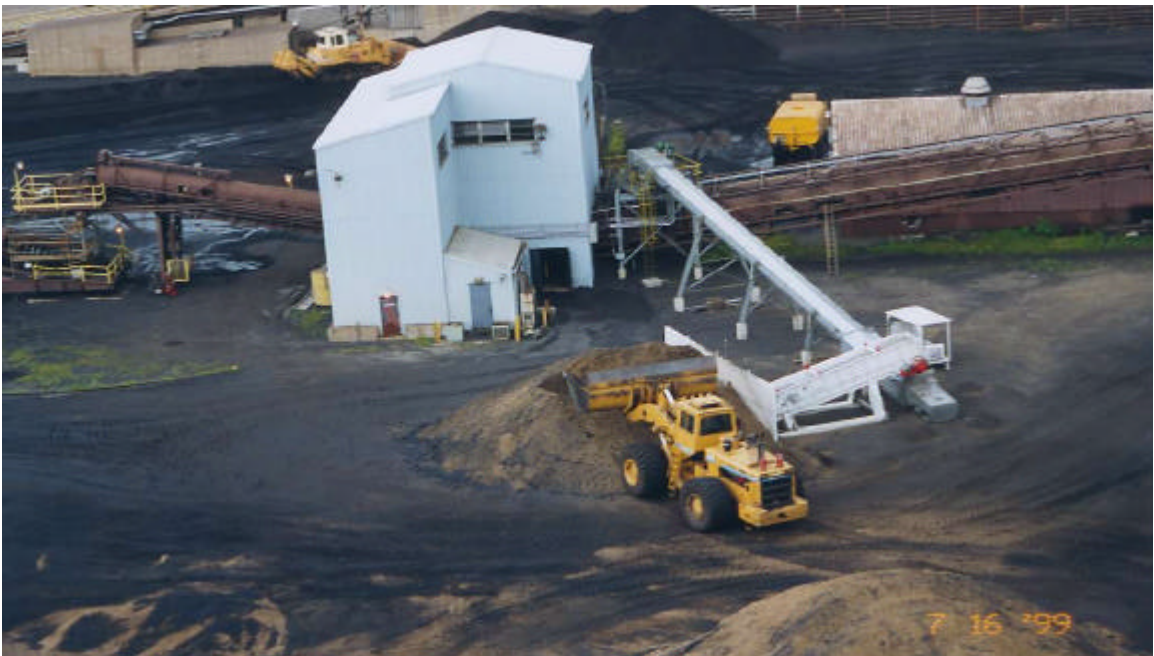
Figure 4. Overview of Opportunity Fuel Reclaim System and Associated Conveyor