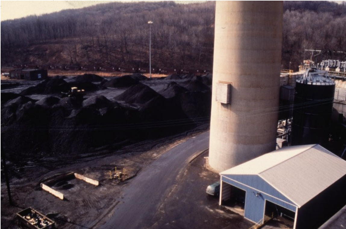
Figure 1. Overview of Seward Cofiring System

This system, depicted in Figure 1, is capable of firing 2.5 ton/hr of sawdust to boiler #12. At 10 \times 10^6 Btu/ton, the sawdust is capable of delivering 25 \times 10^6 Btu/hr to the boiler. Seward Generating Station boiler #12 is a 32 MW unit that was installed in 1946, and has a net station heat rate of \sim 14,000 Btu/kWh. On this basis, the system supports the generation capacity of 1,785 kW of electricity. For this installation, the capital cost is $553/kW of biomass-supported capacity.