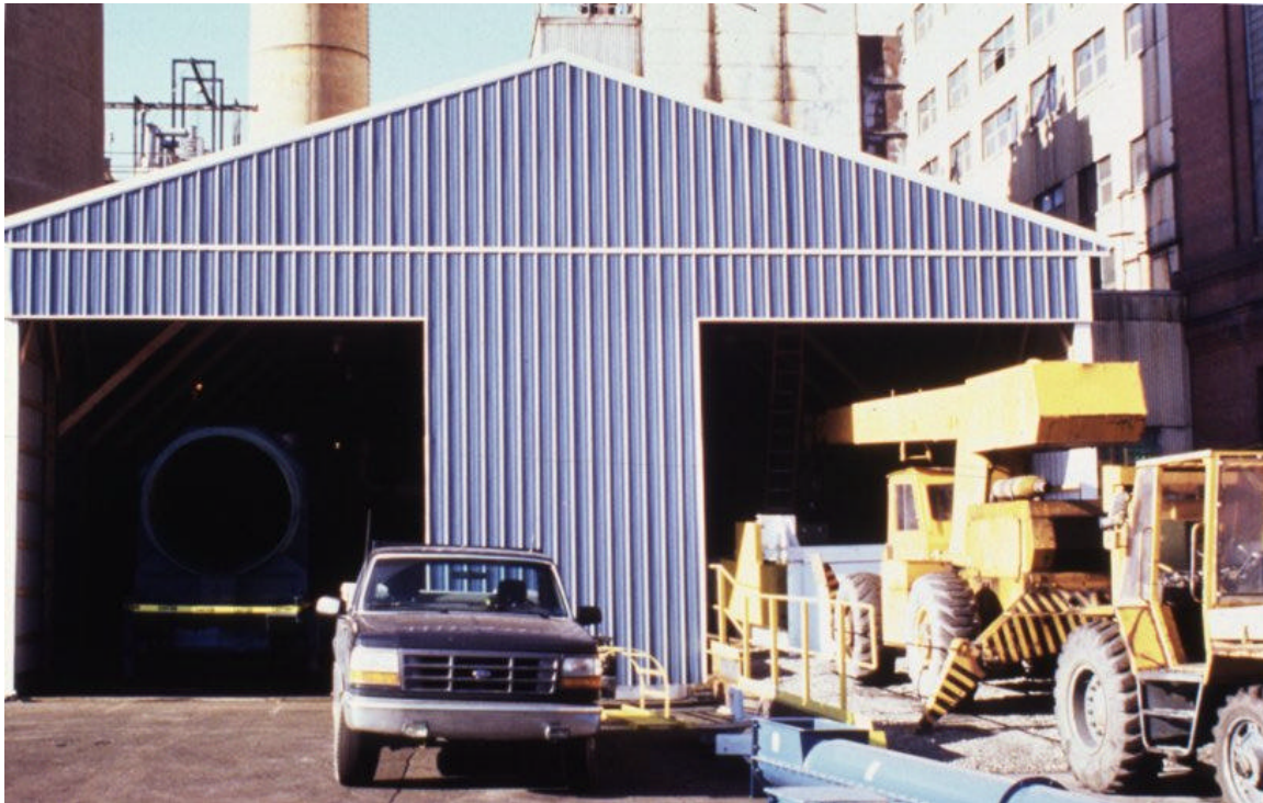
Figure 2. Seward System Showing Locations for the new Truck Unloading and Grinding Equipment. The Truck Unloader will be in the Current Truck Discharge Bay (right) and the Grinder will be at the Trommel Discharge (left).

dump trucks as well as walking floor vans. This design includes increased capacity blowers and rotary airlocks. It adds a fourth blower and airlock in order to cofire in all four corners of the T-fired boiler. The design includes additional piping, and specially designed cofiring sawdust injectors for the T-fired unit. A wood grinder will be installed at the discharge of the trommel to convert oversized biomass into useful fuel. Figure 2 depicts the locations for the new truck unloading system and the oversized wood grinding equipment.