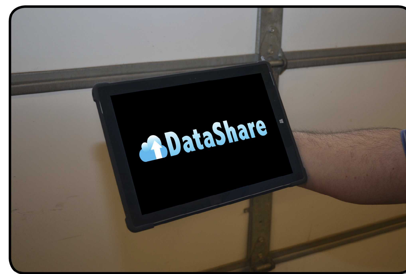
Working point data sharing services application.