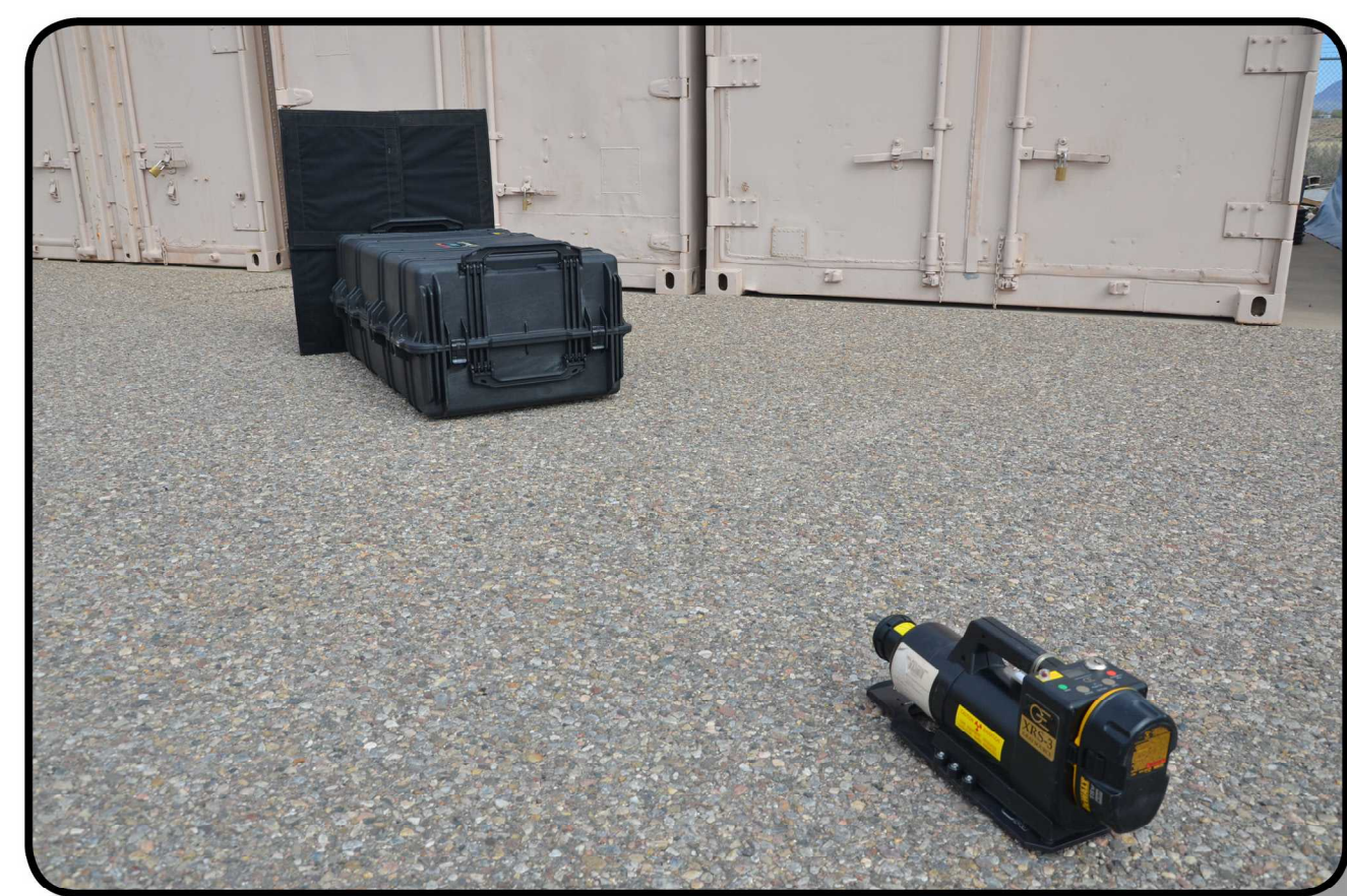
Field radiography data collection.