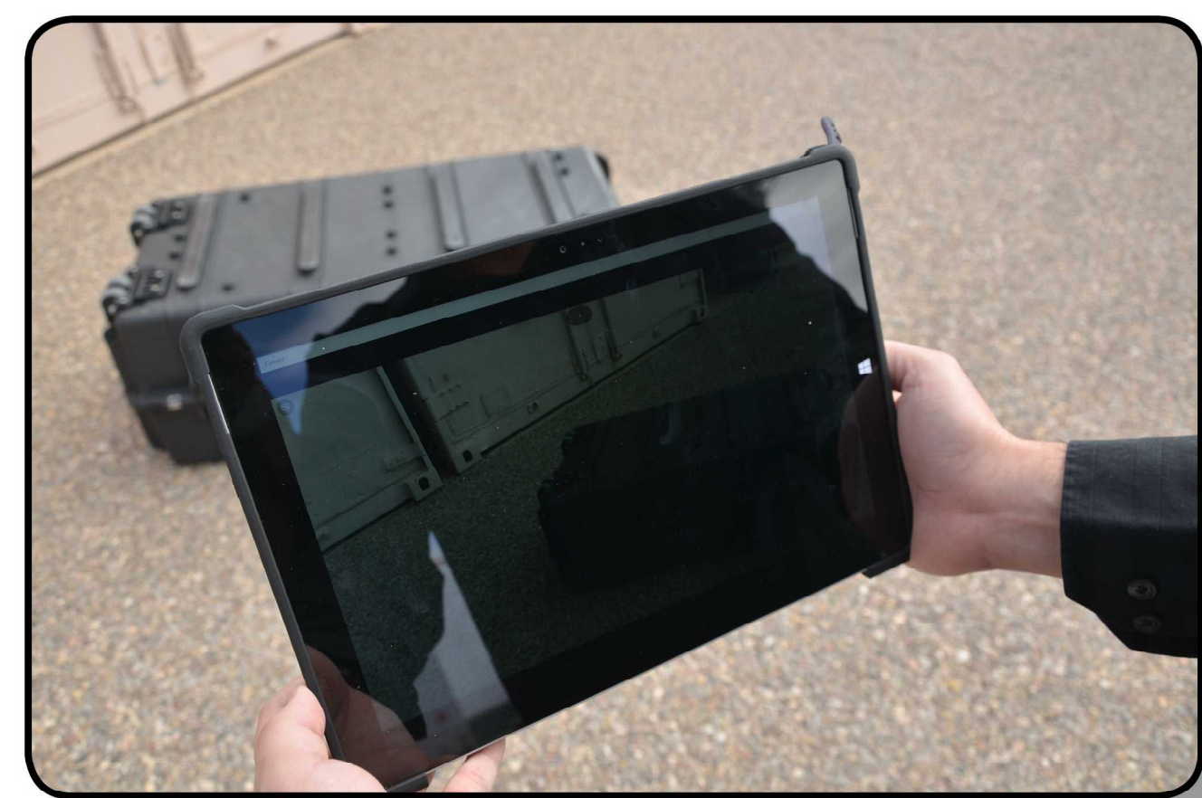
Visual situational awareness data collection.