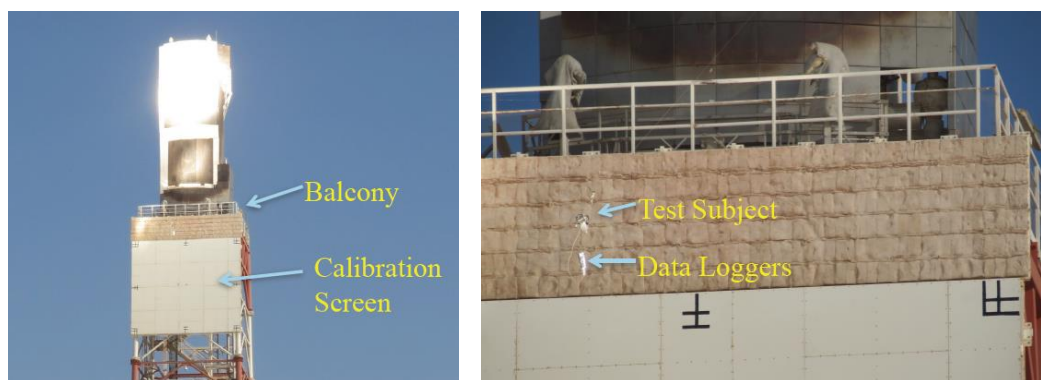
FIGURE 2. Tests conducted by Santolo 7 using bird carcasses exposed to different solar flux levels.

The SEDC is a solar demonstration facility with a 6 MW th heliostat field and power tower. They report that no bird singeing was reported in four years of operation while following U.S. Fish & Wildlife Service protocols of four surveys per week over 20 m transects 6 . As part of the assessments for the proposed Hidden Hills and Rio Mesa power tower plants, Santolo 7 performed tests at SEDC using bird carcasses instrumented with thermocouples under the skin beneath the feathers. The bird carcasses were exposed to different solar flux levels at the SEDC ( FIGURE 2 ), and internal temperatures were taken before and after each test. Following exposure, the carcasses were examined for external effects. If feather effects were observed, the carcasses were examined further for tissue effects through post-exposure dissection. A reference group of birds without feather effects was also examined for tissue effects.