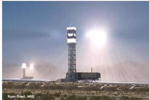
FIGURE 3. Illuminated standby aim points near the receiver at ISEGS before changes were made to spread the standby aim points to reduce the concentrated flux.