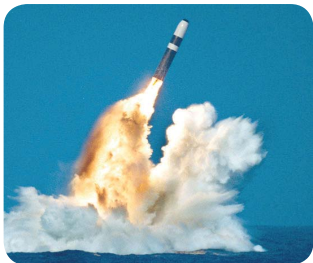
Trident D5 Missile test flight launch.