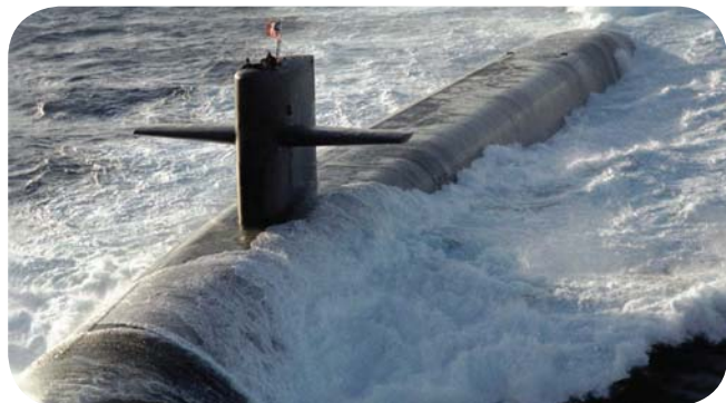
Ohio-class nuclear submarine that might carry a W76-1 warhead.