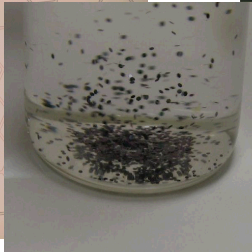
Released c-Si microscale PV cells in IPA