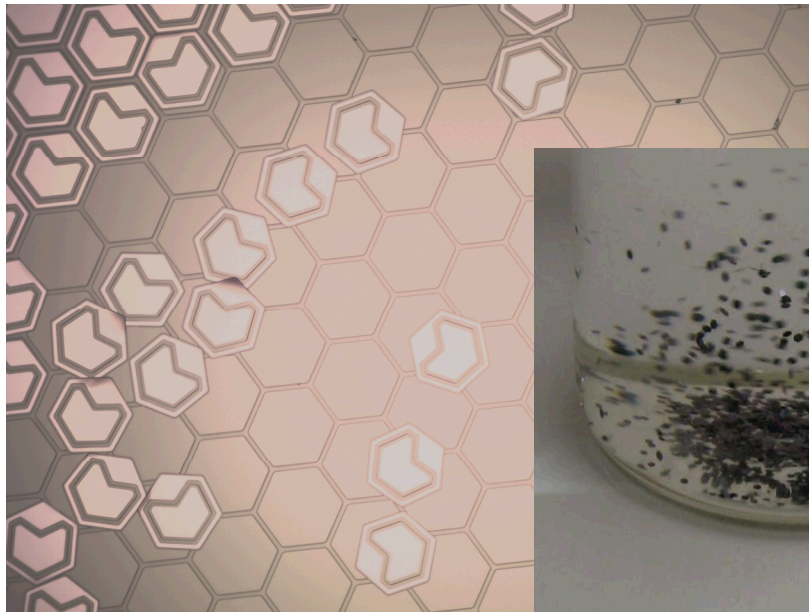
GaAs microscale PV cells being released