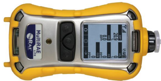
MultiRAE Lite Pumped

The MultiRAE Lite Pumped costs about $950 depending on the configuration. It measures 7.8 x 3.8 x 2.6 inches and weighs about 31 ounces. It can be configured for up to six simultaneous sensors. Sensor options include O 2 , %LEL, H 2 S, CO, NH 3 , VOC, CO 2 , multiple range CO, Cl 2 , ClO 2 , HCHO, HCN, CH 3 SH, NO, NO 2 , PH 3 , and SO 2 . It has a data logger capable of logging 5 sensors for 6 months at a 1-minute interval. It has either a