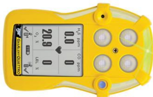
Gas Alert Quattro

The Gas Alert Quattro costs about $700 depending on configuration. It measures 5.1 x 3.2 x 1.9 inches and weighs 11 to 12 ounces. It can include up to four simultaneous sensors and has single button operation. Sensor options include O 2 , %LEL, H 2 S, and CO. In addition to alarms, the display shows continuous sensor readings and calibration status. Power options include either an interchangeable battery pack that is rechargeable or an alkaline battery pack. Manufacturers estimated run time is 21 hours for the rechargeable battery.