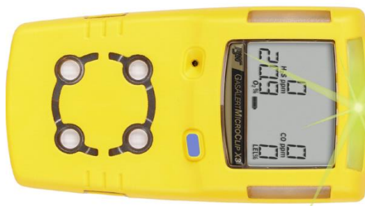
Gas Alert Microclip X3

Alarms include visual, vibrating, and audible. The alarms can be set for various concentration levels and are latching alarms. User options include safe display mode, stealth mode, calibration lock, auto zero on startup, O 2 calibration on startup, and an option to force a bump test when the test is overdue. It includes a 3-year warranty on all sensors.