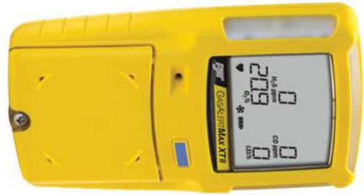
Gas Alert Max XT II

The Gas Alert Max XT II costs about $880 depending on configuration. It measures 5.1 x 2.8 x 2.0 inches and weighs 11.1 ounces. It can be configured to include up to four simultaneous sensors and has single button operation. Sensor options include O 2 , %LEL, H 2 S, and CO. It has a rechargeable battery with a manufacturers estimated run time of 10 hours or an alkaline battery pack. The Gas Alert Max XT II includes the SmartSample pump that combined with sampling tubes, supports remote sampling for confined space entry.