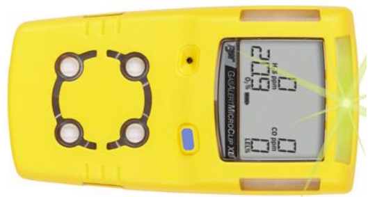
Gas Alert Microclip XL

The Gas Alert Microclip XL costs about $615 depending on configuration. It differs from the Gas Alert Microclip XT in extended battery run time. It is slightly heavier and thicker. It measures 4.4 x 2.4 x 1.2 inches and weighs 6.7 ounces. It can be configured to include up to four simultaneous sensors and has single button operation. Sensor options include O 2 , %LEL, H 2 S, and CO. It has a rechargeable battery with a manufacturers estimated run time of 18 hours or an alkaline battery pack.