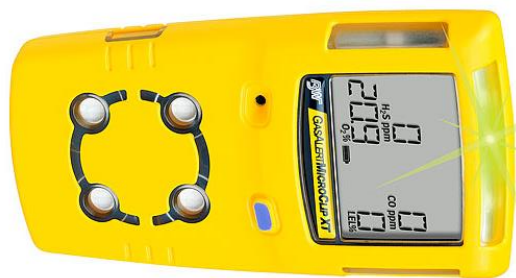
Gas Alert Microclip XT

Alarms include visual, vibrating, and audible. The alarms can be set for various concentration levels and are latching alarms. User options include safe display mode, stealth mode, calibration lock, auto zero on startup, O 2 calibration on startup, and an option to force a bump test when the test is overdue. It includes a 2-year warranty on all sensors.