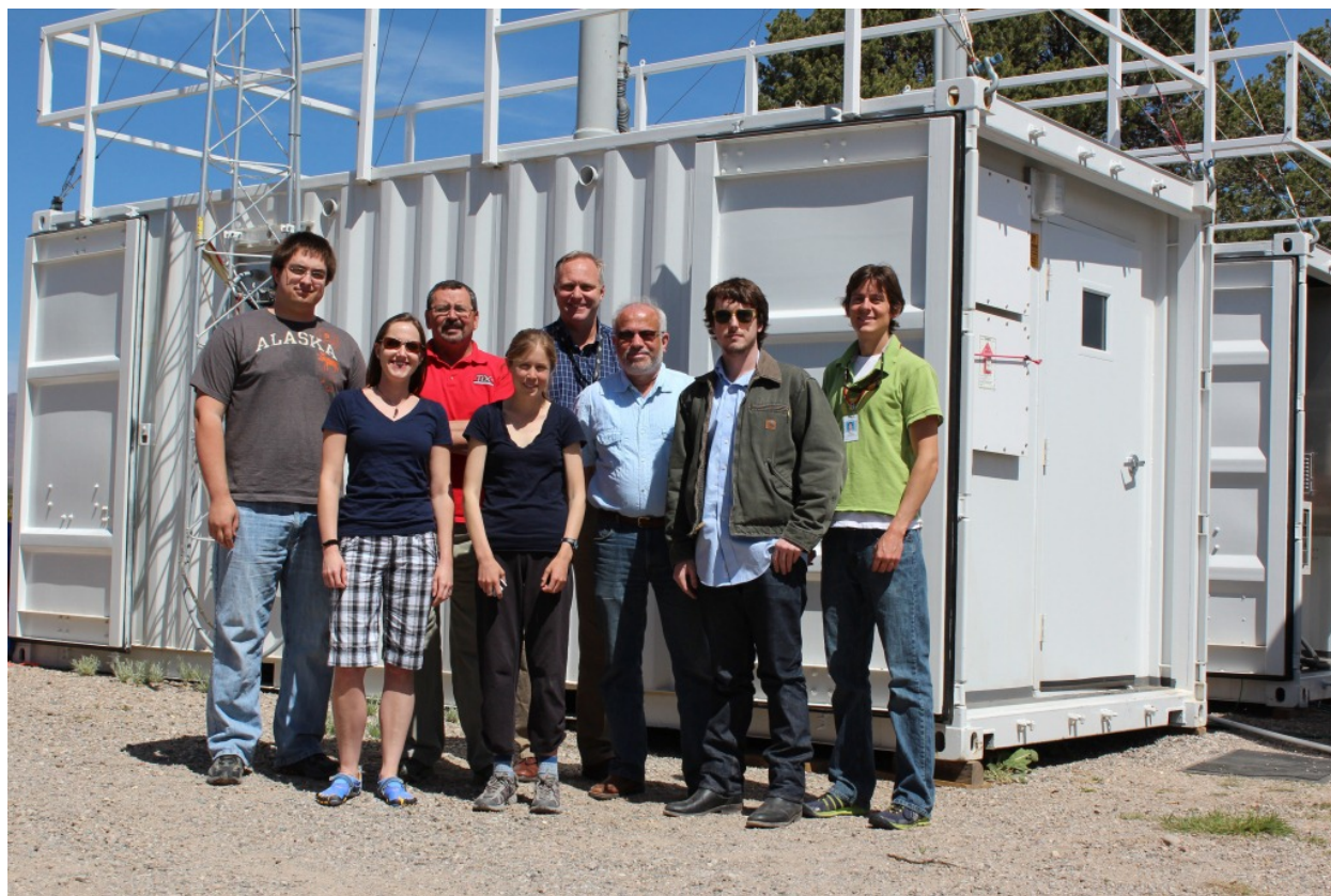
Figure 1. The PACE team.

Between December 2011 and April 2012, a team of researchers (see Figure 1) from Los Alamos National Laboratory (LANL) worked on the Pajarito Aerosol Couplings to Ecosystems (PACE) intensive operational period (IOP). PACE's primary goal was to demonstrate routine Mobile Aerosol Observing System (MAOS) field operations and improve instrumental and operational performance. LANL operated the instruments efficiently and effectively with remote guidance by the instrument mentors. This was the first time a complex suite of instruments had been operated under the ARM model and it proved to be a very successful and cost-effective model to build upon.