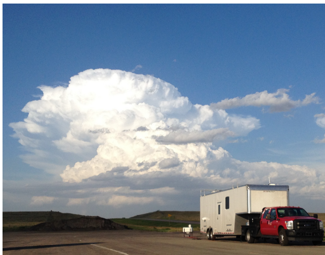
Figure 2. The University of Wisconsin-Madison SPARC facility, which was designated mobile PISA #3, during PECAN. The ARM Doppler lidar is shown deployed on the surface beside the trailer. The SPARC facility included an AERI and a High Spectral Resolution Lidar (HSRL) on board, and was able to launch radiosondes.