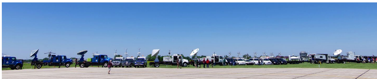
Figure 3. The PECAN mobile instruments at the Ellis, Kansas, airport during the PECAN public relations (PR) day on 30 May 2015.

Several other PECAN outreach events were conducted, including an open house at the Salina, Kansas, airport on 6 July. PECAN field work was featured in several newspaper articles, local TV news bulletins, radio interviews, magazines, blogs, etc. Several of these can be found at http://pecan15.org/home/ .