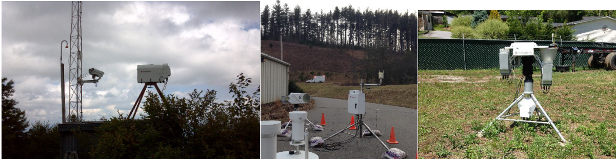
Figure 1. Left to right: MWR2C, eastern MWR3C, and inner region valley MWR3C.

The deployments of the Microwave Radiometers (MWRs) lasted from February 2014-January 2015, with some missing periods that are discussed in Section 3.0. The three setups are pictured in Figure 1.