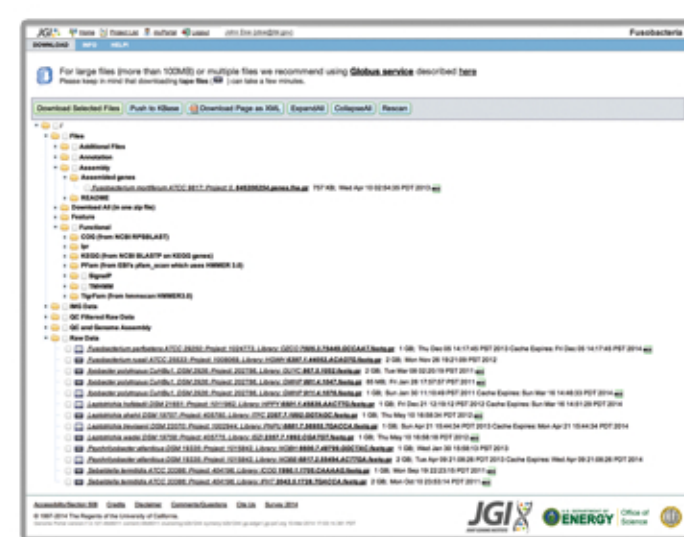
portal web UI

Find your portal of interest and click on the Download tab. Downloads are available in a tree structure that divides the files into logical groups for RAW files, assemblies, and annotation data.