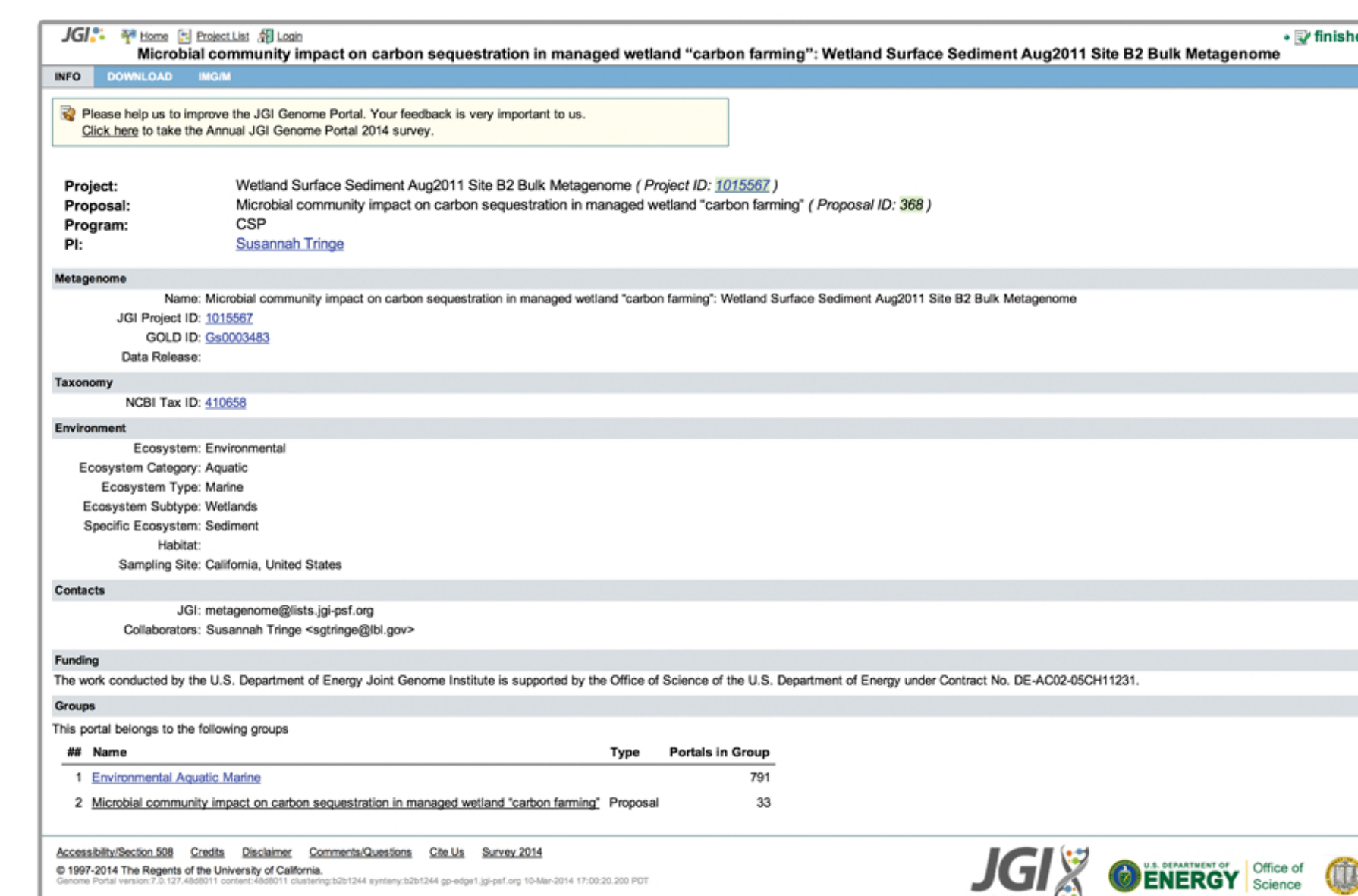
Individual portal page

The Genome Portal also provides access to over 17 000 annotated genomes and metagenomes, along with specialized analytical tools to navigate these data sets and compare genomes.