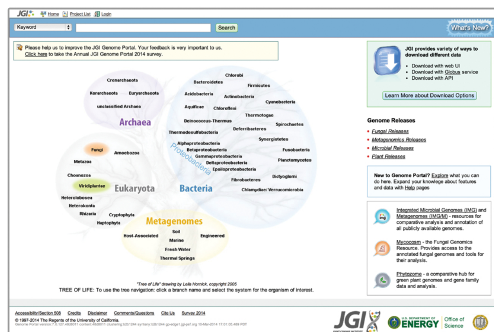
Home page with search

Powerful new search tools support the growing volume of sequence data at the JGI. Users can locate and view sequencing projects using GenBank accession number, taxonomic information, Principal Investigator contact, and many other search terms.