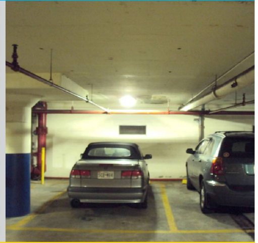
LED luminaire in high state (100% full power)

monitored over more than one year to evaluate their performance.