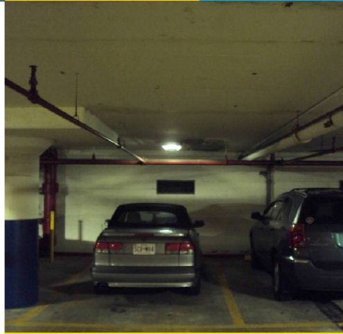
LED luminaire in low state (10% full power)

These factors combined to make the DOL Headquarters' parking garages ideal for a U.S. Department of Energy (DOE) GATEWAY demonstration, which was initiated in 2010. The garages were previously lighted entirely by about 300 high-pressure sodium (HPS) fixtures; 19 of these were replaced one-for-one with LED luminaires in one section of a middle floor for this study. These LED luminaires, which each have an integral occupancy sensor that can control their output through bi-level dimming, were