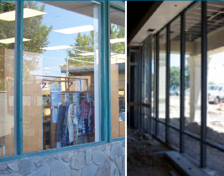
Original storefront windows with no thermal breaks (left) were replaced with new glazing providing thermal breaks and control of solar heat gain (right)

Many of the direct energy costs to Regency occur in lighting for common spaces including the parking lot. In addition, the CBP team expects high performance lighting will significantly reduce the lifetime maintenance costs as lights require less frequent visits from a maintenance crew to replace the fixtures.