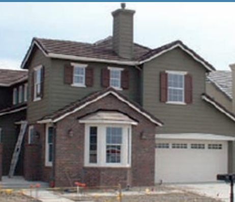
A PowerSave Plus Model Home in the Lunaria Development.