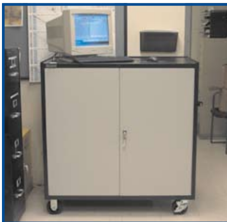
Photographs of Off-Line LIBS Batch Analyzer Installed at a PPG Fiber Glass Plant