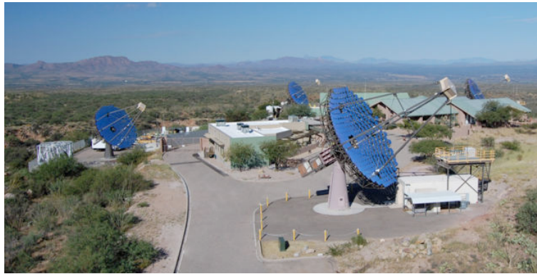
Figure 1: The VERITAS array of imaging atmospheric-Cherenkov telescopes in Arizona.

threshold, allowing its science goals to be accomplished more quickly and enabling fresh looks at topics previously addressed by VERITAS.