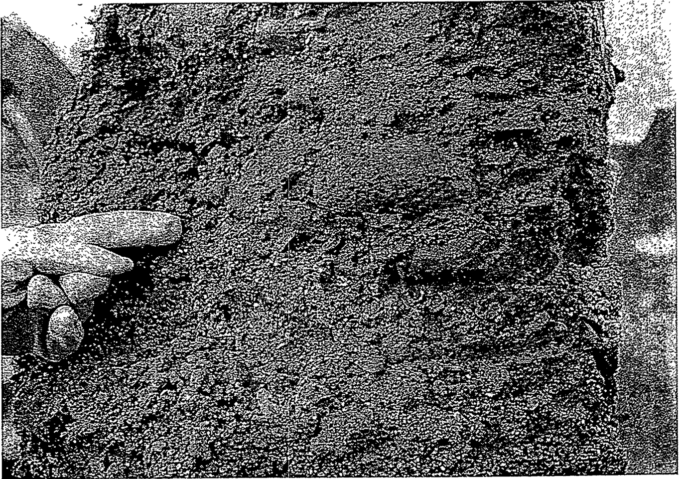
Figure 2. Excavated portion of the CS grouted soil. Note the extreme heterogeneity of the soil, indicated by the particle size and the appearance of the granular material.