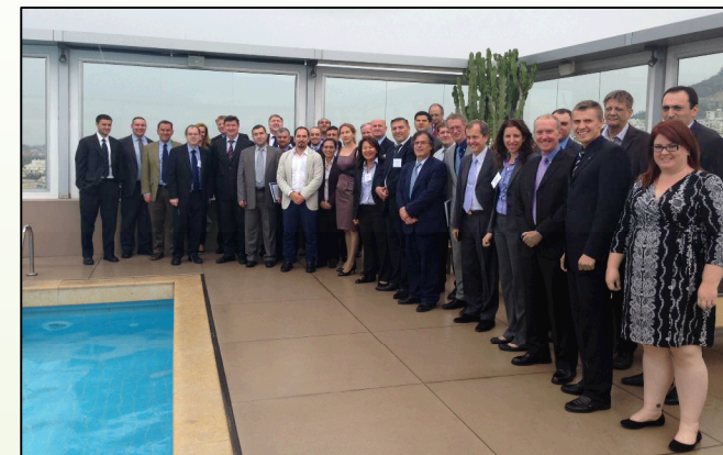
Athens, Greece – Fall 2013