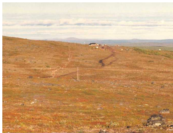
ARCESS Seismic Network 1986