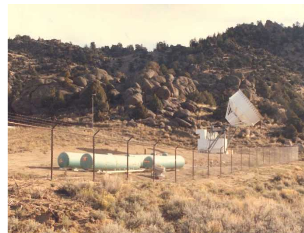
Deployable Seismic System 1990