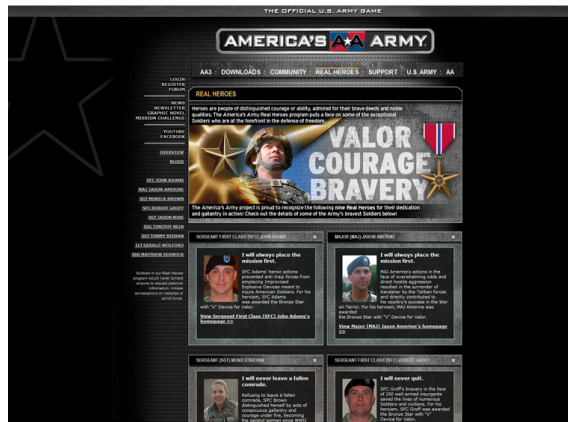
Figure 1. America's Army Real Heroes.

Transmedia campaigns have also been used for Defense strategic communication is the America's Army franchise. The America's Army first person shooter game was conceived by Colonel Casey Wardynski of the US Army Economic and Manpower Analysis as a strategic communication tool to aid with recruitment, and especially to reach a fanbase of young people who were not likely to have had a family member that was in the US Army. Widely popular since 2002 with millions of fans worldwide, there have been over 26 publicly available versions released. The game is available by free download ( http://www.americasarmy.com ).