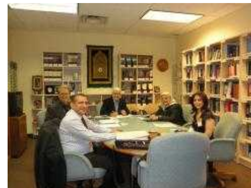
ERDS Technical Visitors