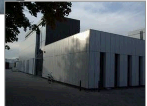
Pertussis Vaccine Facility Multi Purpose Plant GMP, BSL2, GMO1 2004 - 2006