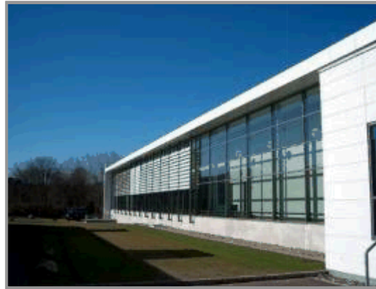
Polio Vaccine Facility GMP, BSL3 enhanced 1999 - 2004