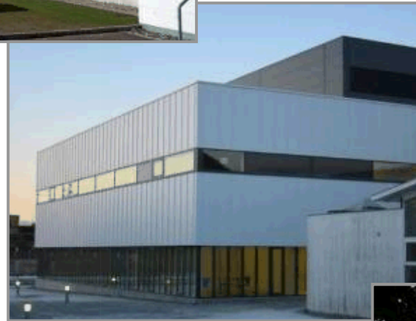
Animal Facility BSL2, BSL3, GMO1 2003 – 2005