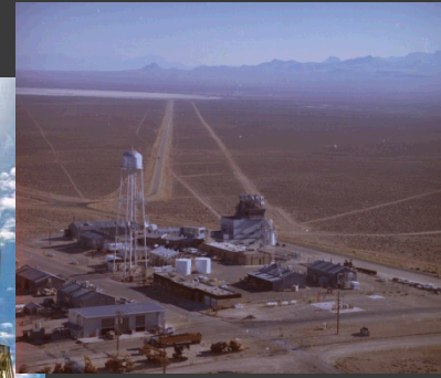
Tonopah Test Range (TTR)