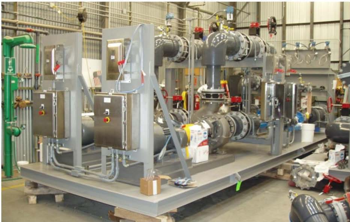
Figure 13 - 2W P&T Fluidized Bed Reactor Pump

Plastic debris left behind from the fabrication process of several fiberglass tanks resulted in multiple Bio Plant influent pump and Fluidized Bed Reactor pump (Figure 13) strainer shutdowns, which required corrective maintenance evolutions to remove the plastic and impacted progress on the Operational Test Procedure. Although internal tank inspections were conducted for foreign objects, the condition of the internal plastic liner of the tank was not readily visible via the manway access.