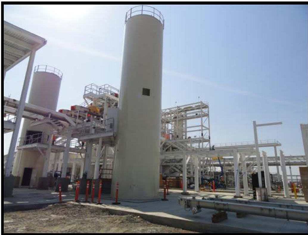
Figure 10 - 2W P&T Lime Storage Silo