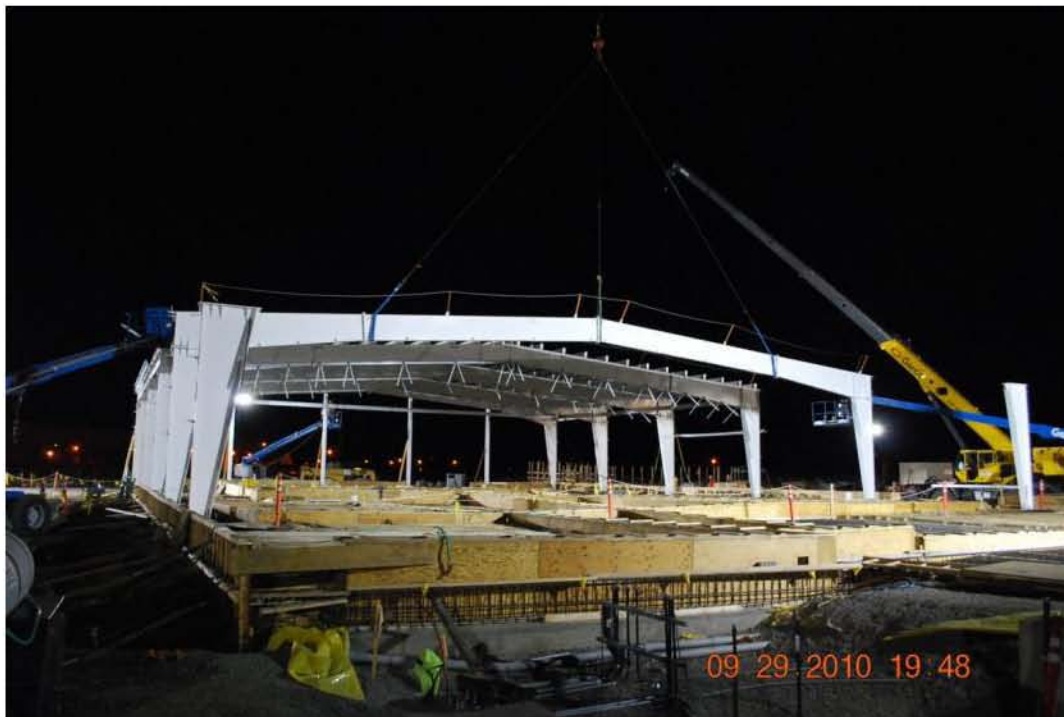
Figure 11 - Steel Erection of Rad Building at 2W P&T

The project received multiple design-related requests through the formal submittal process as a result of construction interferences and in response to the contractor's request for information. Waiting to incorporate the technical solution into revised issued-for-construction drawings through the design change notice process caused delays to the construction progress/schedule. As a result, the Project implemented a "redline" approval process for minor design field changes, which provided an expeditious way to respond to the contractor's needs without hindering production performance. Figure 11 and Figure 12 depict steel and scaffold erection activities completed using the "redline" process.