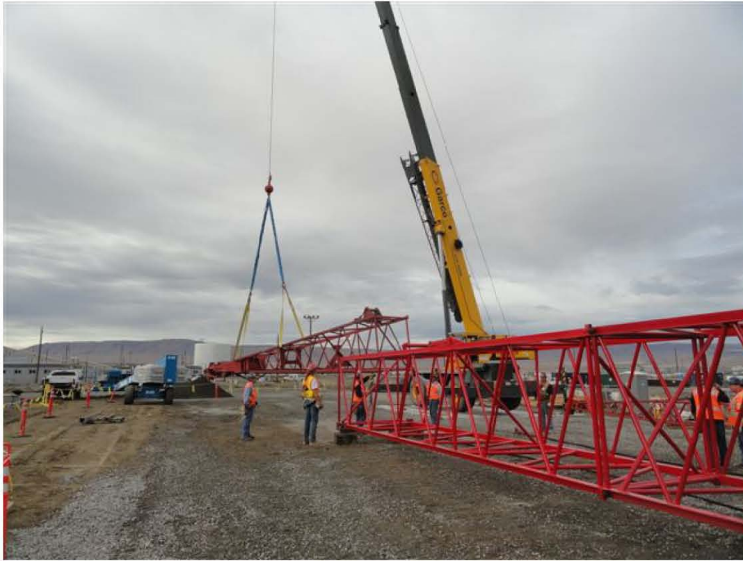
Figure 6 - Assembly of 100-Ton Crane at 2W P&T