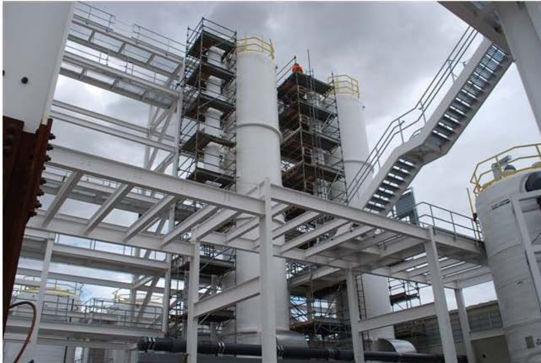
Figure 12 - Scaffold Erection at the Air Stripper Towers at 2W P&T