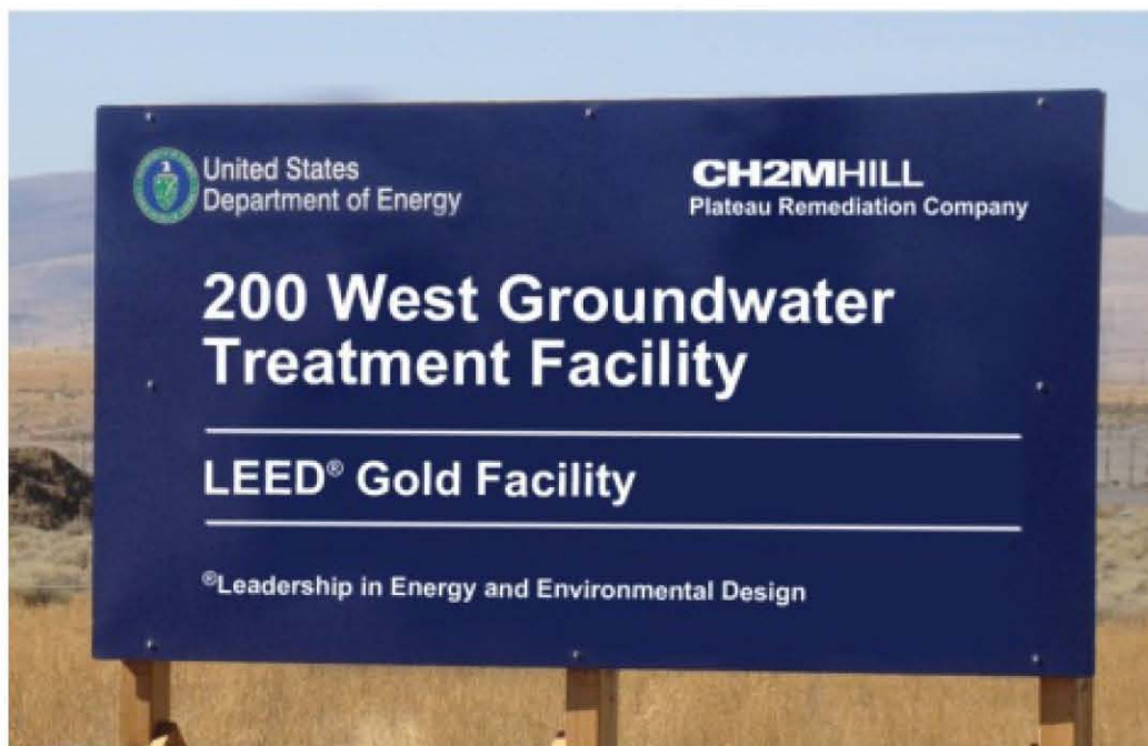
Figure 1 - LEED Gold Facility

There were many contractual, technical, configuration management, quality, safety, and LEED challenges associated with the design, procurement, construction, and commissioning of this $95 million, 52,000 ft groundwater pump and treatment facility. This paper will present the Project and LEED accomplishments, as well as Lessons Learned by CHPRC when additional ARRA funds were used to accelerate design, procurement, construction, and commissioning of the 200 West Groundwater Pump and Treatment (2W P&T) Facility to meet DOE's mission of treating contaminated groundwater at the Hanford Site with a new facility by June 28, 2012.