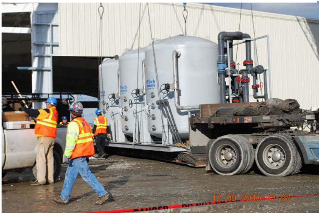
Figure 7 - Delivery of Avantech IX Tank Skid for the 2W P&T Project