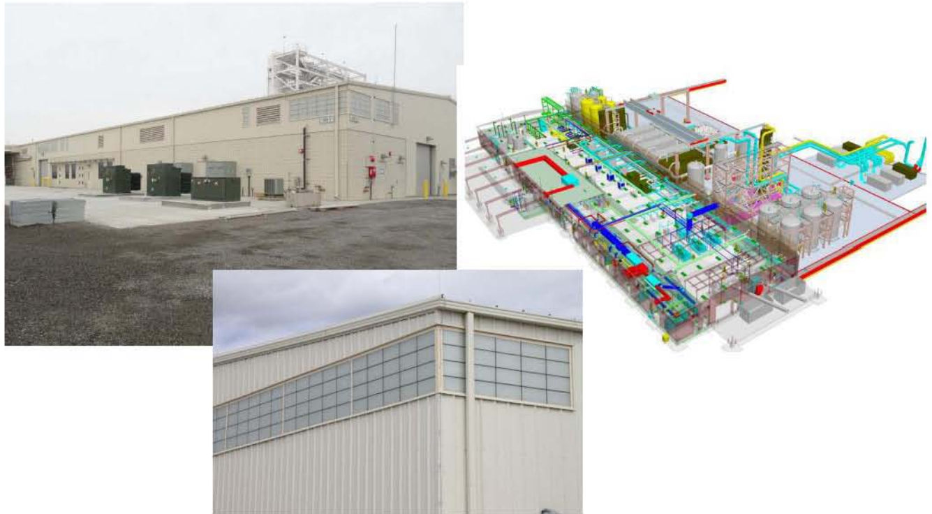
Figure 5 - 2W P&T Energy-Saving Design

The building's efficient design is expected to result in an energy cost savings of more than 70% over the life of the facility. The building will also meet new DOE-mandated green building standards that address site sustainability, water efficiency, renewable energy, conservation of materials and resources, and indoor environmental quality. (Figure 5 shows the energy efficiencies.)