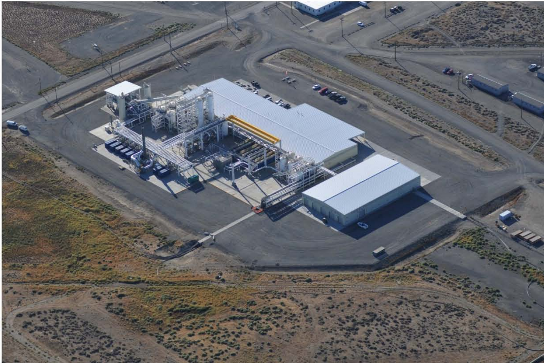
Figure 3 - 2W P&T Facility

The 2W P&T Bioprocess Facility is 52,000 ft 2 (4831 m 2 ) and has a flow capacity to treat approximately 2,500 gpm (9464 liters), with future expansion capabilities to treat 3,750 gpm. The 2W P&T Facility was designed, constructed, and tested to treat the following contaminants of concern: Carbon tetrachloride, trichloroethylene, total chromium, hexavalent chromium, nitrate, and technetium 99.