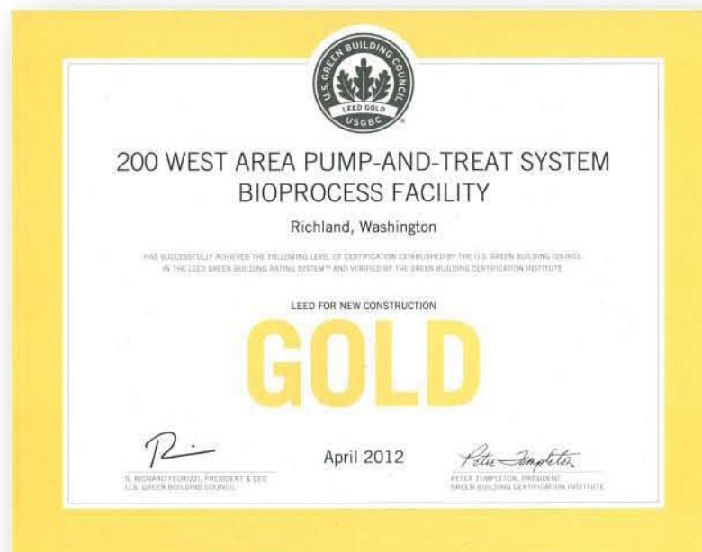
Figure 4 - LEED Gold Certificate

The 2W P&T Facility's LEED gold certification for sustainable design was the first gold certification (Figure 4) in the DOE Office of Environmental Management complex of sites that conducted nuclear weapons development and government-sponsored nuclear energy research.