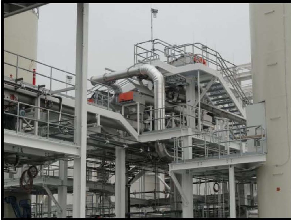
Figure 9 - 2W P&T Lime System Process Piping Overview