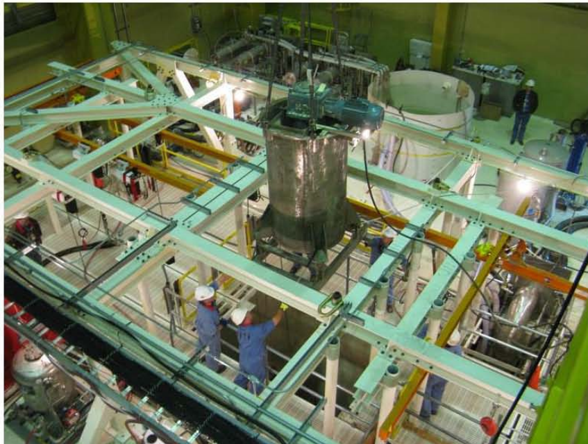
Fig. 3. Engineered Container Retrieval and Transfer System Prototype.

The prototype facility, shown in Figure 3 below, also was used in 2011 for technology development of systems to retrieve remote-handled transuranic sludge stored in underwater containers with particle sizes less than 6350 \mu\text{m} and load the sludge into containers for transportation and interim storage. During 2011, full-scale prototype systems were developed and tested to TRL 6.