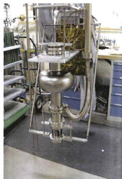
Figure 2: The 805 MHz cavity with a moveable coupler and a vacuum line attached at the bottom.