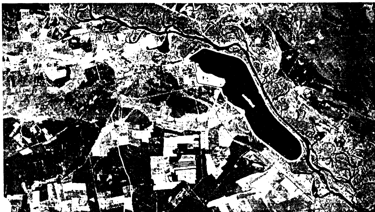
Figure 3. SPECTRUM visualization of Chernobyl Landsat image, original data (top) and after wavelet-KLT compression (bottom) with r=0.15 bpp channel. Actual observed compression ratio was 63.3:1.