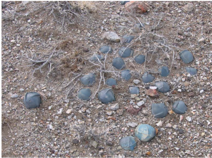
Fig. 3. Submunitions on target surface.