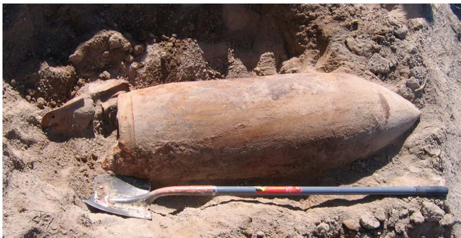
Fig. 4. An example of other munitions uncovered during excavation and surface clearance (M117A1, 340-kg bomb, uncovered in Mid Target Grid 53/816).