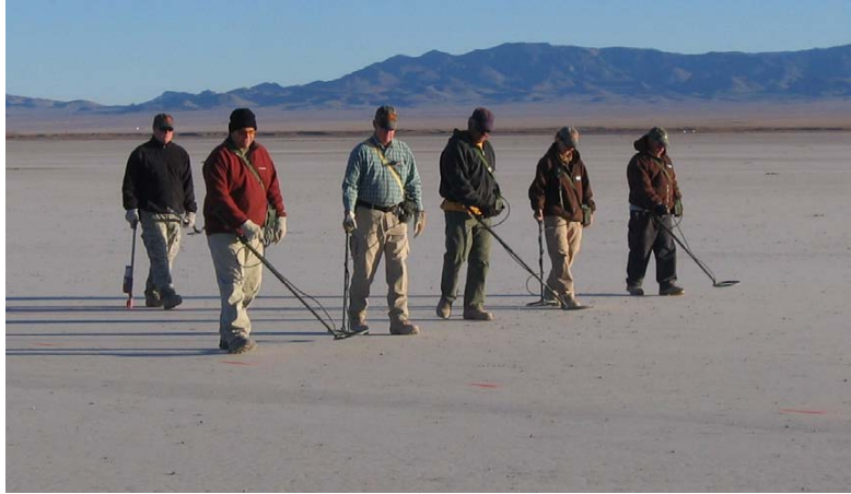
Fig. 2. Surface clearance.