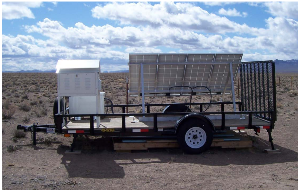
Figure 3. Station 401, solar powered air sampler.

Air samples are collected every two weeks from Station 401 as well and delivered to the laboratory on a quarterly basis for batch processing. Between August 2008 and May 2009, 21 air particulate filter samples were collected and analyzed. Only naturally occurring radionuclides were measured on the samples. Be-7, K-40 and Pb-210 were the most frequently measured radionuclides followed by Pb-212, and Bi-214. No anthropogenic gamma emitting radionuclides have been detected on any sample.