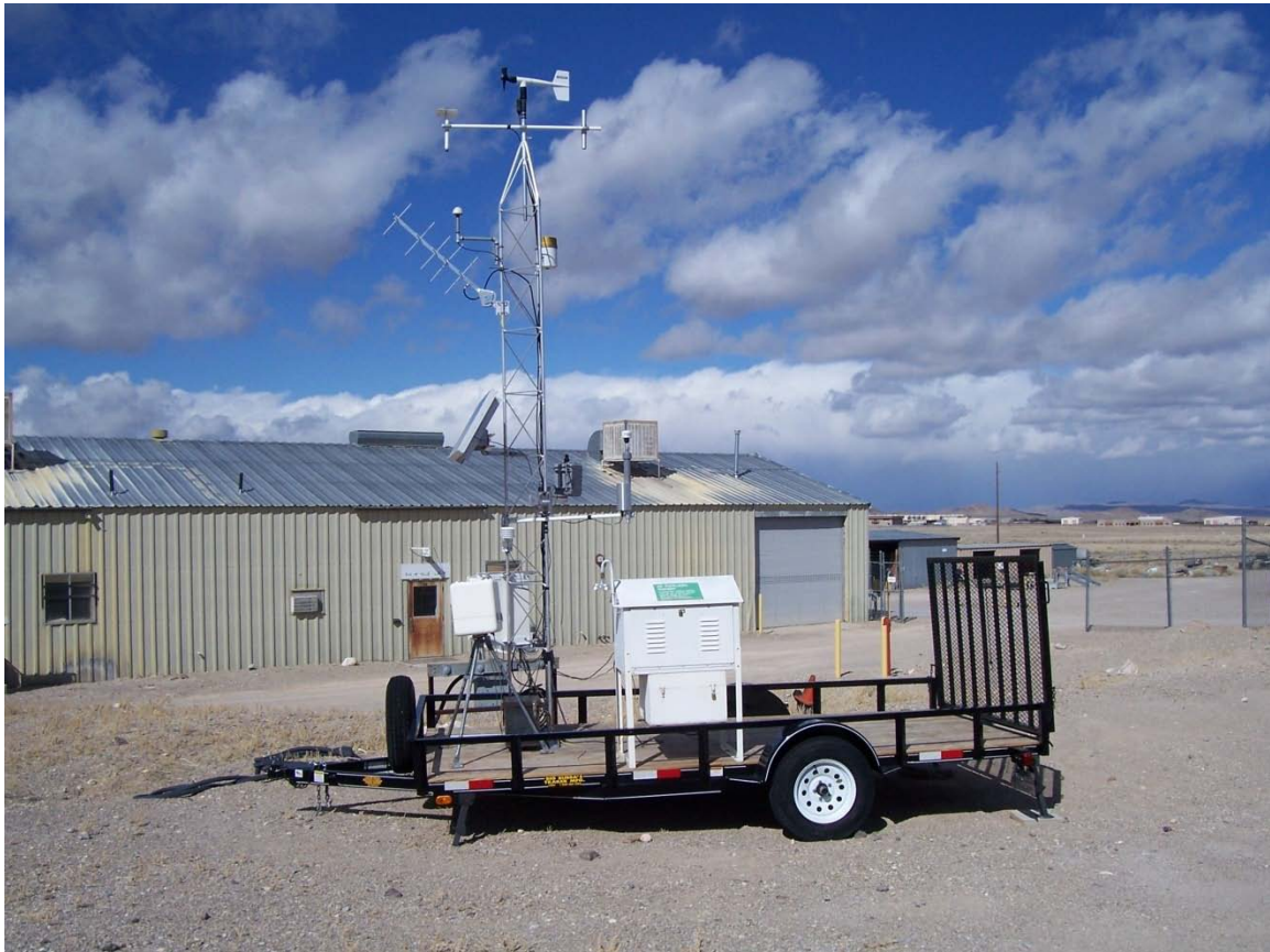
Figure 2. Station 400 (PEMS) near ROC.

The station is also equipped with a continuous air particulate sampler from which 4" air filter samples are collected every two weeks. Between May 2008 and May 2009, 27 air particulate filter samples were collected and analyzed by gamma spectroscopy and for gross alpha/beta activity. Only naturally occurring radionuclides have been identified and measured on these samples. Beryllium (Be)-7 and Potassium (K)-40 were the most frequently measured radionuclides followed by Lead (Pb)-210, Lead (Pb)-212, and Bismuth (Bi)-214. No anthropogenic gamma emitting radionuclides, e.g. Cesium (Cs)-137, Cobalt (Co)-60, or 241 Am have been detected on any sample.